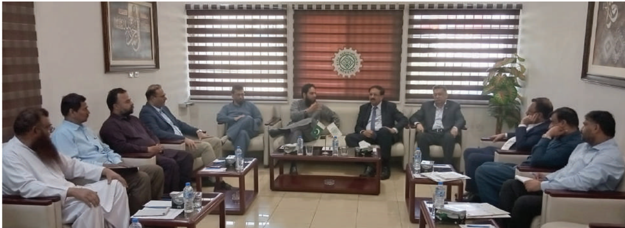
A view of participants of meeting with KWSC high officials