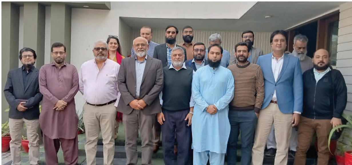
Group photo taken on the occasion of visit of CDO K-Electric to SITE Association of Industry