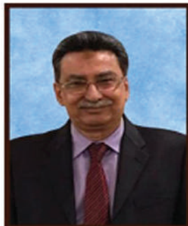
Sr. Vice President