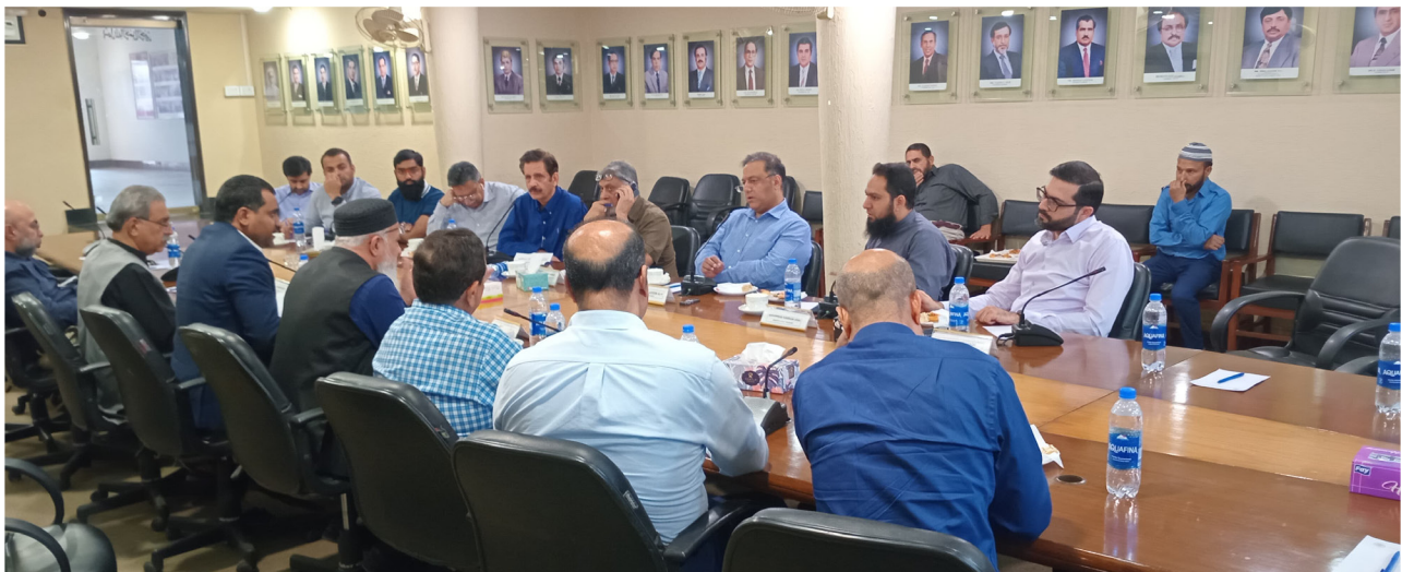
Officials from SSGC SITE office visited S.I.T.E. Association of Industry