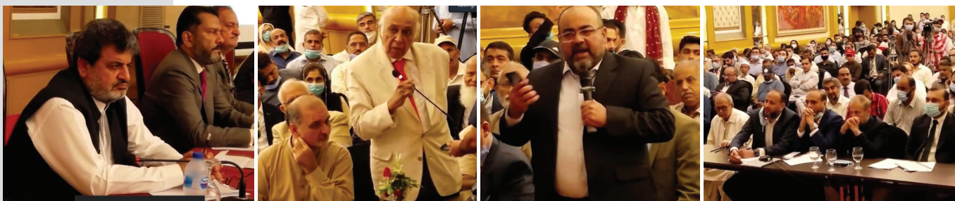
Photos taken on the occasion of NEPRA hearing to decide APM in the License of K-Electric.

“At least 3 to 4 companies should be issued license for distribution and sale of electric power instead of just one, in order to ensure a competitive pricing, quality of service and maintenance of infrastructure.”