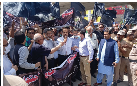
Protest held in front of SITE Limited office on 10-9-2020.