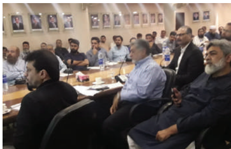
Participants of Presentation on wastewater treatment by Mehran University of Engineering & Technology, Jamshoro.