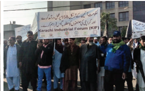
Picture taken on the occasion of Protest staged at SSGC Head office against Gas crisis.